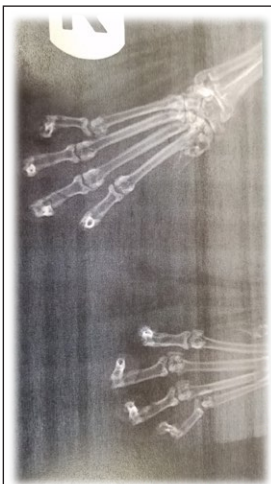
X-ray of alumni Gomer's paws. He was returned to DCHS after being declawed and exhibiting litterbox and pain issues.

Then how do I keep my cat from scratching my furniture, you may ask. There are many alternatives to declawing, the simplest being nail trims and scratching posts. Trimming a cat's nails every week or two keeps them short and blunt, and scratching posts give an appropriate place for their natural stretch and scratch instinct (at the shelter we notice that sisal rope posts and cardboard scratchers are feline favorites) - there is even catnip spray available that you can use to attract them to these. "Soft Paws" or nail caps that go over your cats nails with adhesive are also available, and you can even get them in fun colors! If you find that your cat is scratching where you would prefer they do not, double sided tape works quite well to deter scratching there.